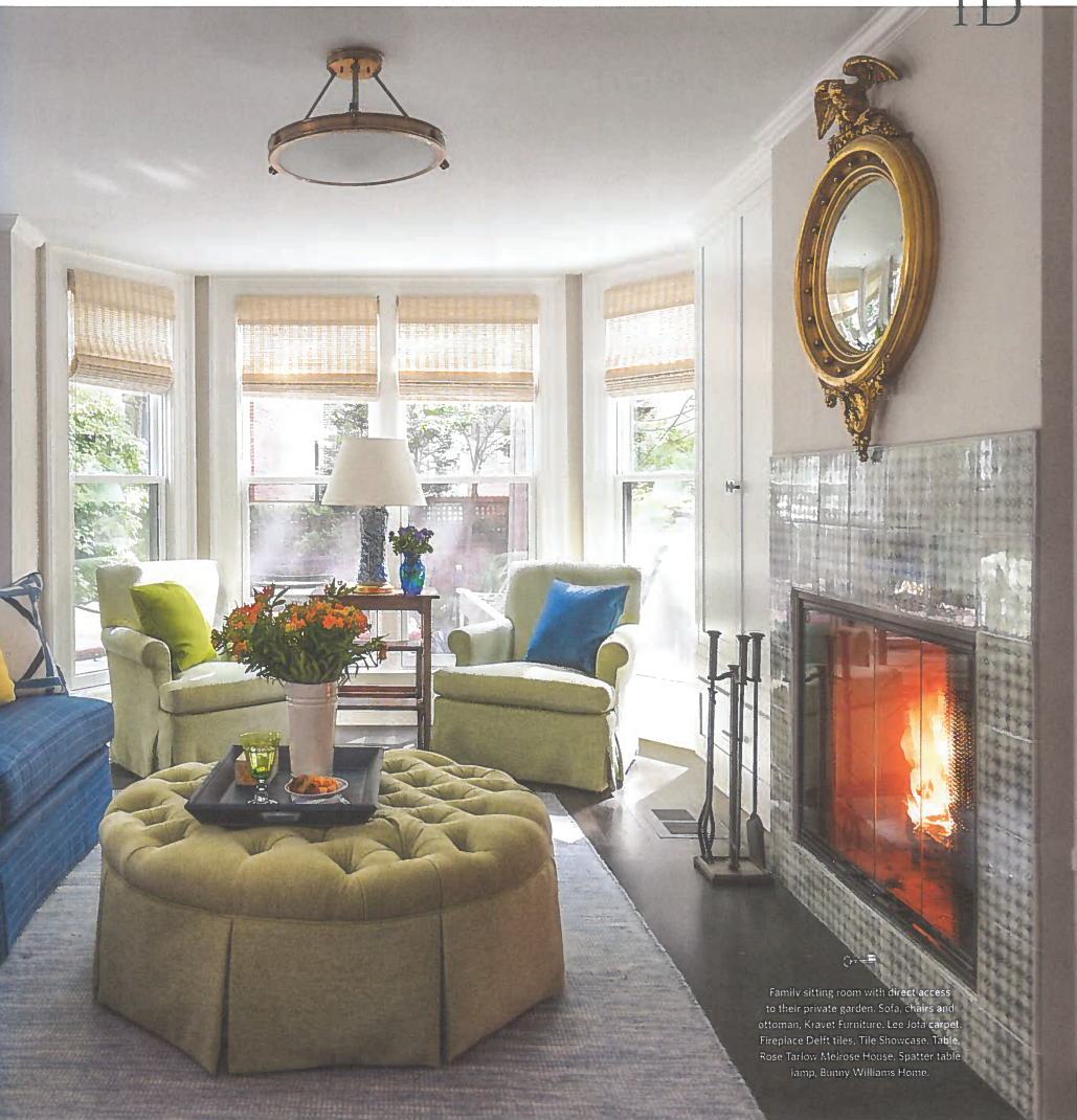
Family sitting room with direct access to their private garden. Sofa, chairs and ottoman, Kravet Furniture; Leo Jola carpet. Fireplace Delft tiles; Tile Showcase. Table, Rose Tarlow; Melrose House. Spatter table lamp, Bunny Williams Home.