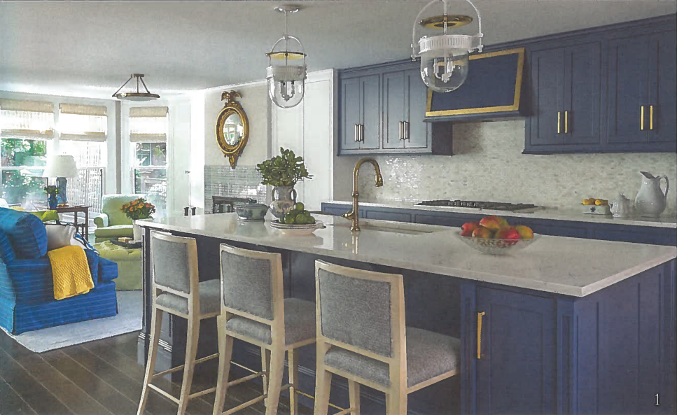
1 Custom cabinetry painted Farrow & Ball Drawing Room Blue with brass hardware, trim and faucet. Kravet counter stools, lights above counter from Urban Electric. 2 Banquet seating for family dining. Antique blue and white plates mixed with Christopher Spitzmuller Delft blue marble plates accent the walls. Table is Eero Saarinen by Knoll. Buffalo check fabric, Kravetz. Pendant, Neirmann Weeks. 3 Her desk. Custom pin board, striped fabric, Manuel Canovas. Chair, McGuire.