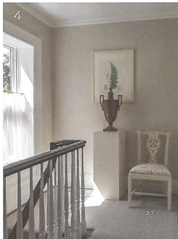
1 Master bedroom. Custom headboard, bedskirt and curtain fabric Schumacher Sarawak Paisley/Alabaster. Stark carpet. Vintage chandelier, Niemann Weeks. Bedside lamps, Vaughan. French chairs, Charles Spada. Gilded stack tables, Vaughan. Table lamp, Rose Tarlow. Wallcovering, Phillip Jeffries. 2 Master bath. Trim and cabinetry paint, Farrow & Ball All White. Floor tile, Tile Showcase. Sconces and pendant, Vaughan. 3 Youngest daughter's bedroom. Wallpaper, Willowbrook by Jane Churchill. Carpet, Landry & Arcari. Lantern, Circa Lighting, custom painted. 4 Second floor landing to the master bedroom. Urn, Charles Spada. 5 Oldest daughter's bedroom. Wallpaper, Iconic Scalamandré zebra in periwinkle. Lantern, Circa Lighting, custom painted.