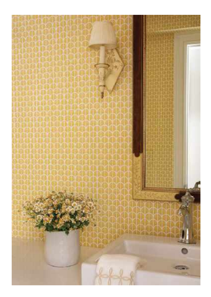
A cheerful powder room on the lower level shines with a Thibaut Hillock wallcovering and metallic finishes.

an elegant GP & J Baker (gpjbaker.com) Oriental Tree wallcovering sets the tone for the rest of the house. "It was kind of daunting about where it starts and where it ends, because there wasn't really any definition," Pomeroy explains. "We wanted to define a little bit of a foyer, so when we walked in, we designed a drape table that is more or less a console table, as well as storage underneath one of their beautiful period mirrors and defined it a little bit there." Straight back, the library adds even more depth thanks to paint by Farrow & Ball (farrow-ball.com) that continues the soft aqua color palette in a richer hue. Fun plays with pattern peek through with the lounge chairs, which are decked out in Lee Jofa (kravet.com), fabric. An antique Irish writing desk from the 1800s, purchased originally for their Milton home, sets the tone. Behind it, a photograph by Carin Ingalsbe through Lanoue Gallery (lanouegallery.com) continues to draw those who enter the home into the space. Back into the receiving room, two paths await: up or down. Downstairs leads right into the garden-level kitchen, where